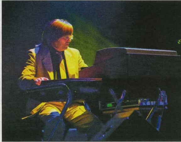
Strange Days, a tribute band to The Doors, will bring perform at Repplier Park on Thursday, Aug. 21 at 7:30 p.m.